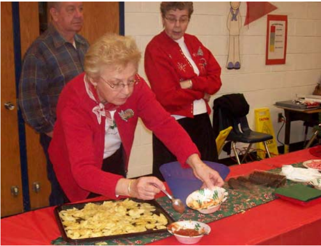
There was great food. . .