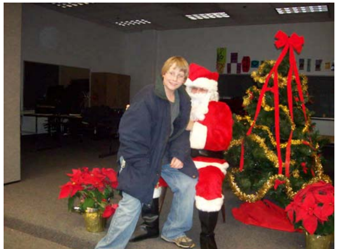
And lots of kids, young and old!