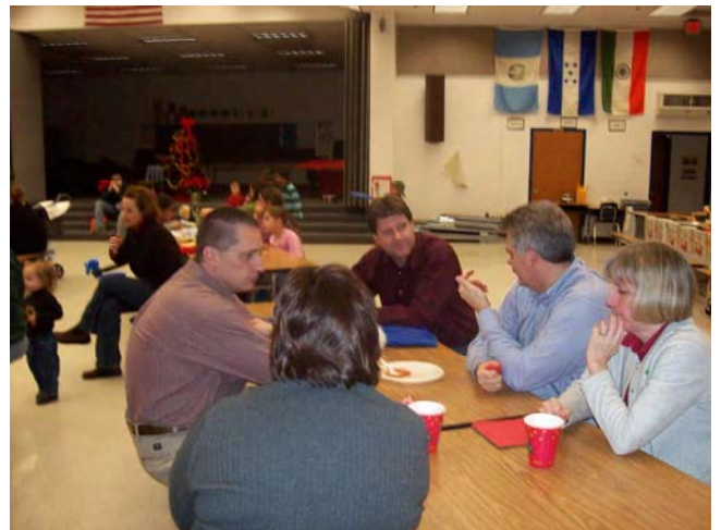
Board members, past and present. . .