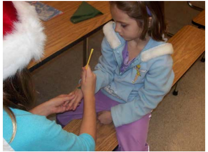
face and hand painting. . .