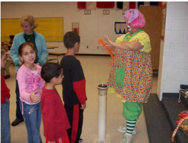
special balloons from LuLu. . .